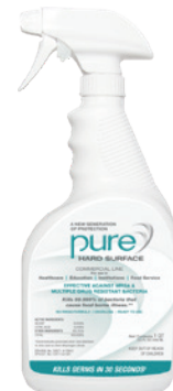
32 oz. Quart